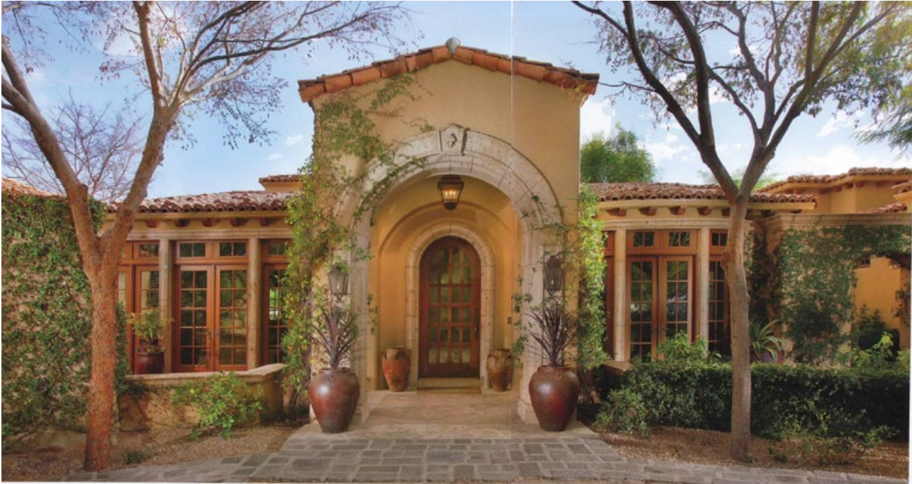
A pair of Chinese elm trees and terra-cotta pots draw the eye to the entry of this charming home. Its exterior is lush with Lady Banks' roses, and its facade features cantona-rimmed archways leading to a wood-and-glass-paned entry door. The residence was designed to tie indoor spaces to outdoor areas. French doors from the dining room (left) and home office (right) lead to twin low-walled courtyards.