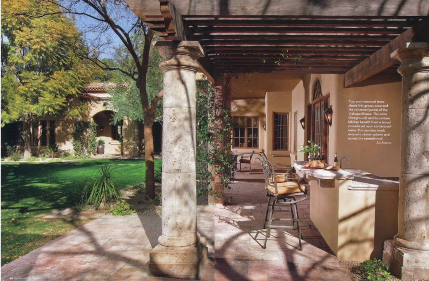
Tipu and ironwood trees shade this grassy area and the columned portal of the U-shaped home. The patio (foreground) and its outdoor kitchen benefit from a broad ramada set upon castero columns. Star pattern winds around a center column and across the ramada roof. Sue Suarez